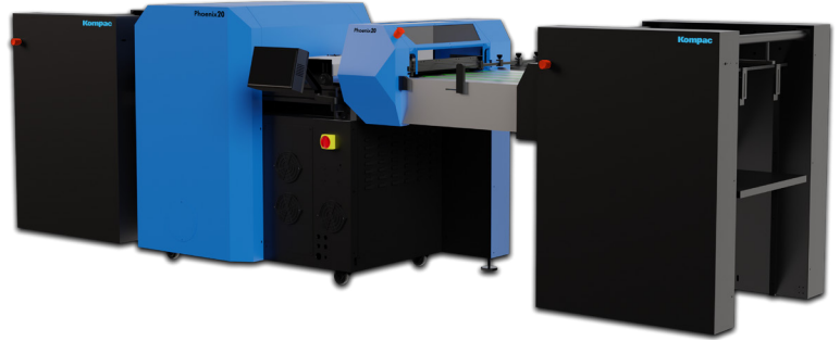
Phoenix 20 S, shown with available pallet feeder and pallet stacker.

The Phoenix is a revolutionary new coating/priming system that is the most modular system available. The system can utilize one, or multiple coating and curing stations and utilizes our unique Kompac IOtech4 platform.