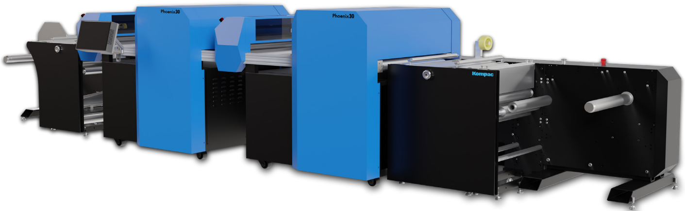
Phoenix 30 R, shown with available unwind and rewind.