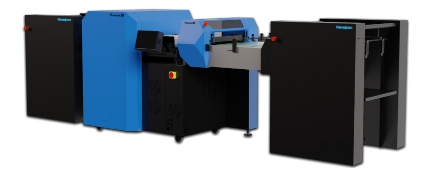
Phoenix 20 S, shown with available pallet feeder and pallet stacker.

The Phoenix is a revolutionary new coating/priming system that is the most modular system available. The system can utilize one, or mulitple coating and curing stations and utilizes our unique Kompac IOTech4 platform.