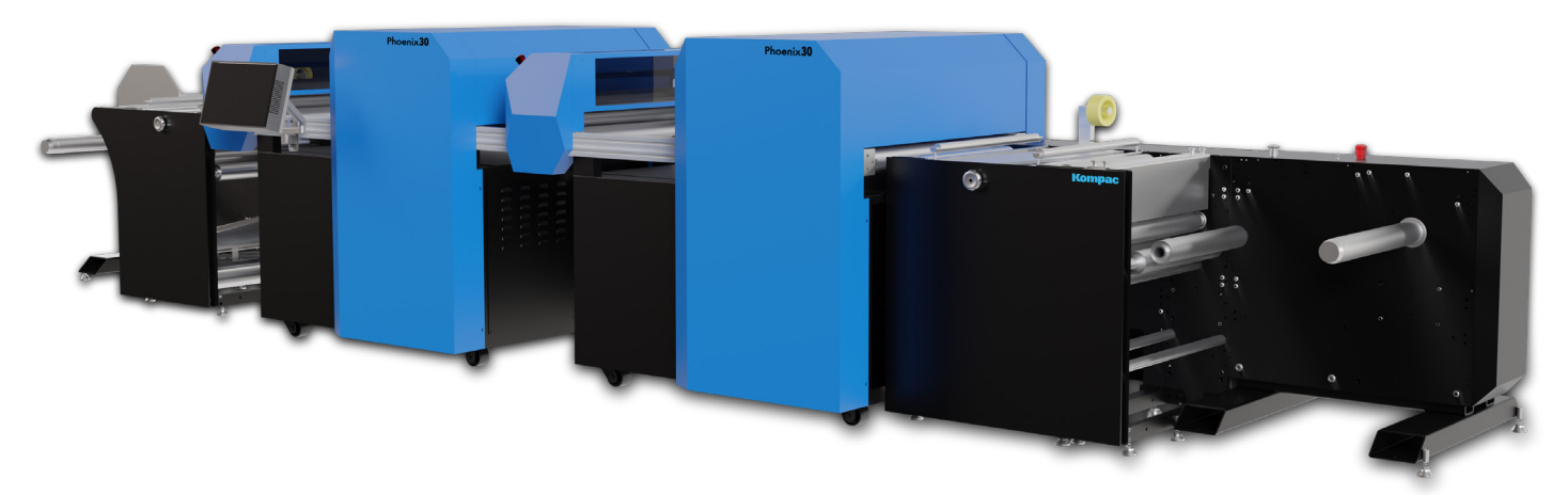
Phoenix 30 R, shown with available unwind and rewind.